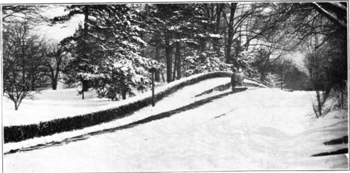
"Your Association's horse-drawn plow goes through every road in Merion after each snow storm."

The police committee of the Township insists upon a strict compliance with the Township's ordinance concerning the clearing of sidewalks after each snowfall. Your Association wishes to direct particular attention to this matter because of the annoyance that always follows a summons for violation of this ordinance. In order to break the paths through the snow and to make its removal easier your Association's horse-drawn plow goes through every road in Merion after each snowstorm. This service frequently is worth more to the property holder than the amount of his annual subscription to this Association.