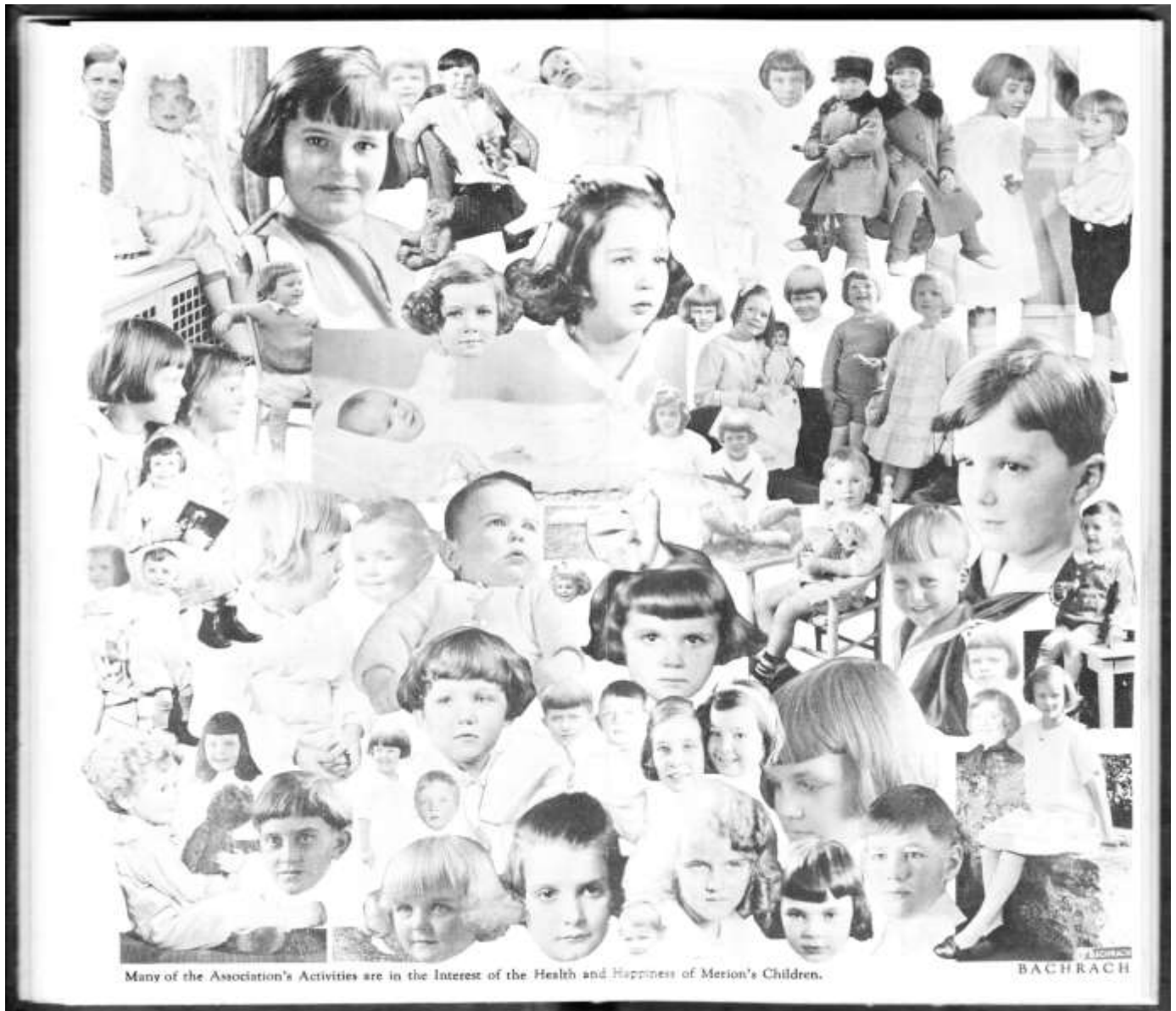
Many of the Association's Activities are in the Interest of the Health and Happiness of Merion's Children.