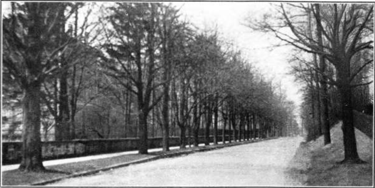
Part of the row of 58 shade trees on Wynnewood Avenue.